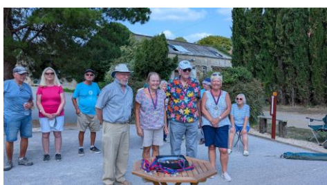
3rd place team