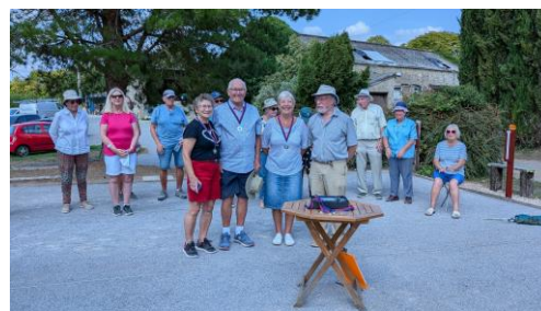
2nd place team